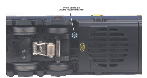
Figure 2: Manual Loco-Sound Volume Adjustment

To adjust the volume of all sounds made by this engine, turn the master volume control knob located next to the fuel tank clockwise to increase the volume and counter-clockwise to decrease the volume.